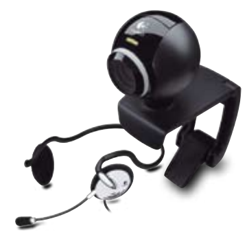
QuickCam® E 3500 Plus

Video calling on your notebook made easy An affordable, portable webcam with a built-in microphone for simple and fun video calls wherever you are. The 640 x 480 VGA resolution ensures your videos and photos are rich and vibrant.